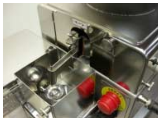
Fine dosing-SPA - AAA

S.S.T.-Schüttguttechnik Maschinenbau GmbH